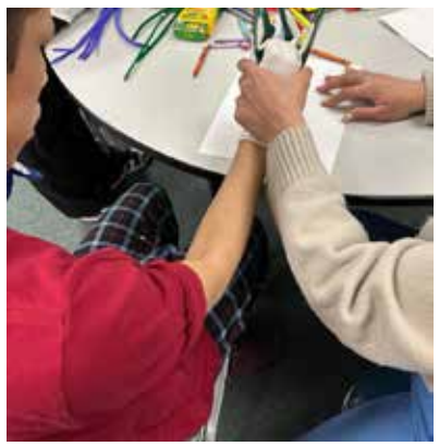
OUR NEW SENSORY PROGRAM FOR ADULTS WITH DISABILITIES