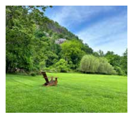
MINDFULNESS AT MARYDELL