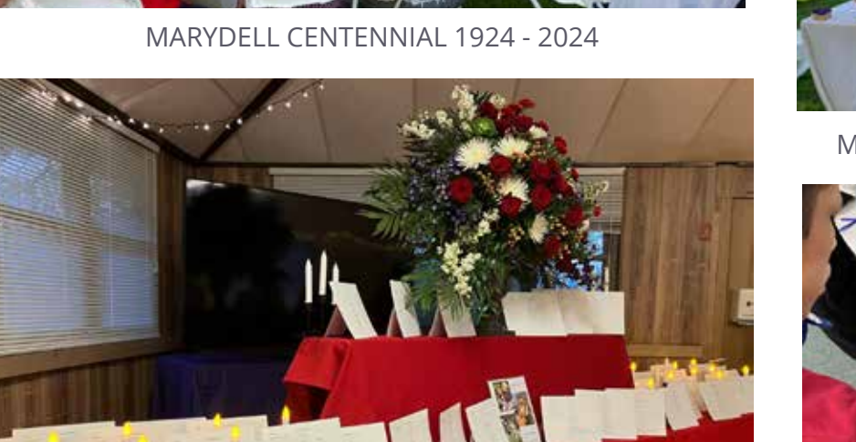
OUR TREE OF PEACE & LIGHT 2024