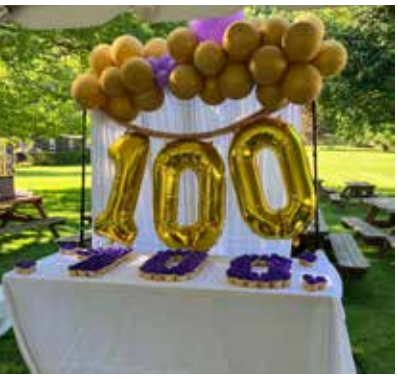
MARYDELL 100 YEARS