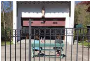
ONE OF MY DELIGHTS DURING THIS PANDEMIC TIME IS WATCHING HOW OFTEN PEOPLE ARE STOPPING TO PRAY AT OUR CHAPEL. PRAISE GOD!

I hope you enjoy the stories we have for you in this newsletter. I still smile when I remember George, our turkey, and I can only smile when I see the eagerness with which our volunteers work on the children's garden and our other programs.